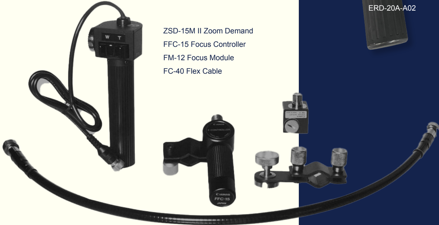
ZSD-15M II Zoom Demand FFC-15 Focus Controller FM-12 Focus Module FC-40 Flex Cable

Allied Broadcast Group has a wide selection of Full Servo and Semi Servo controls for both Box and ENG lenses. Reach out today to discuss your needs with our expert sales representatives!